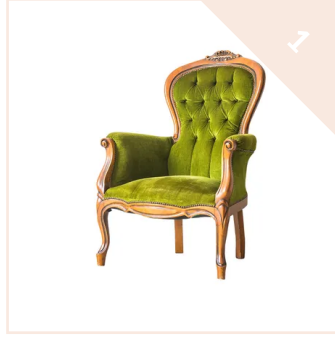
SLADE CHARTREUSE CHAIR