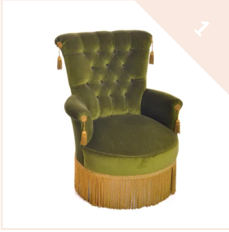
QUIN GREEN CHAIR