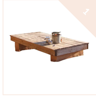
NEWMAN PALLET TABLE